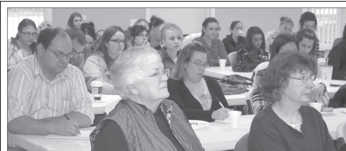
Over thirty nursing students, hospital personnel, area nursing home and insurance representatives attended the presentation held at the Advanced Technology Center.