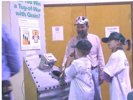
Children learn how much strength is needed to save a life during the session “ Grain Bin Suffocation. ”