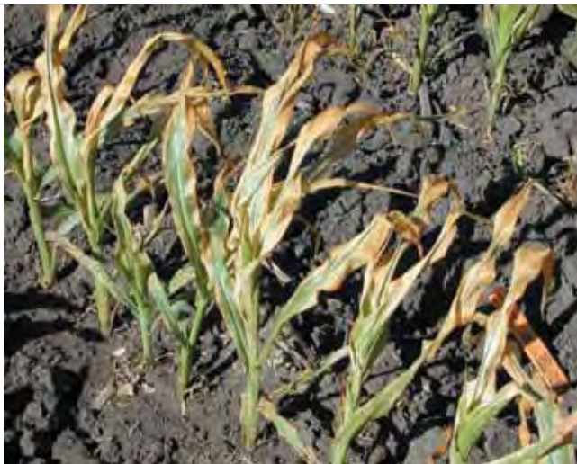
Broadcast solution nitrogen