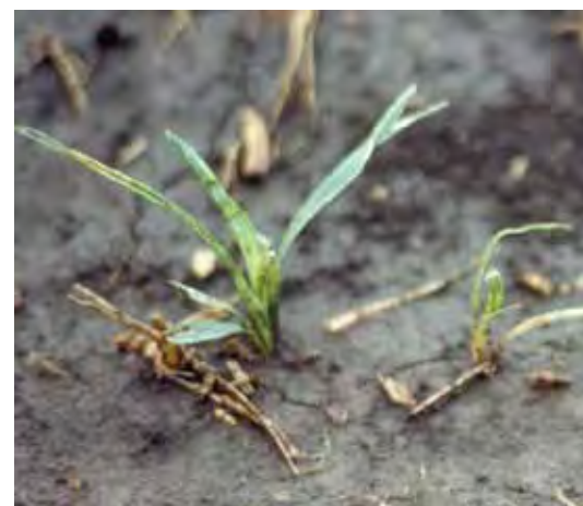
Seed-placed urea stand loss and biuret damage