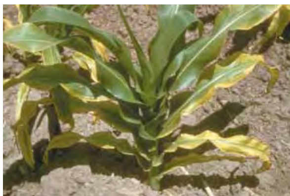
Potassium deficiency in corn, lower leaves

Nutrient deficiency symptoms occur as yellowing of leaves, interveinal yellowing of leaves, shortened internodes, or abnormal coloration such as red, purple, or bronze leaves. These symptoms appear on different plant parts as a result of nutrient mobility in the plant.