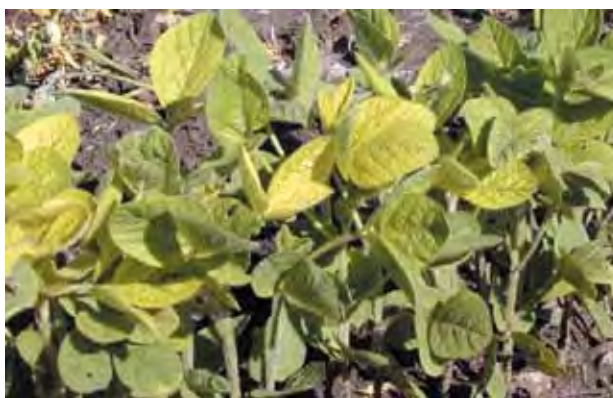
Iron deficiency in soybean, upper leaves