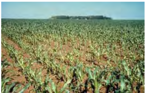
Zinc deficiency in corn

Diagnosing nutrient deficiency symptoms is most reliable when all factors other than the nutrient in question favor normal growth and when the symptoms occur on several plants in an area following a specific soil or management pattern. Comparison of plants in affected and non-affected field areas, as well as other information like soil tests and cultural practices, can help determine specific causative factors.