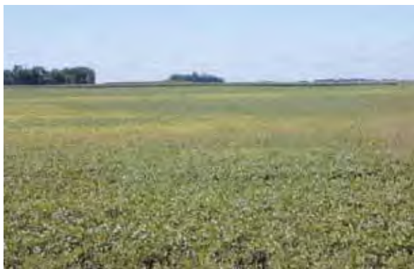
Iron deficiency in soybean