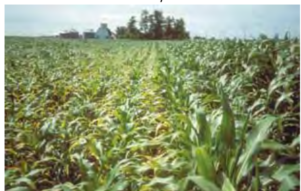
Potassium deficiency, not chiseled (left), chiseled (right)

Nutrient deficiency symptoms that occur in irregular patterns in a field are probably due to a soil condition.