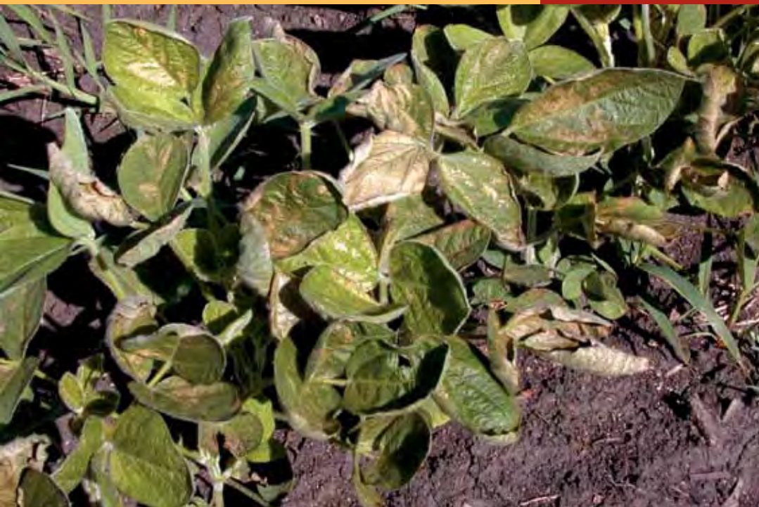
Broadcast nitrogen solution