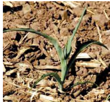
Anhydrous Ammonia Injury