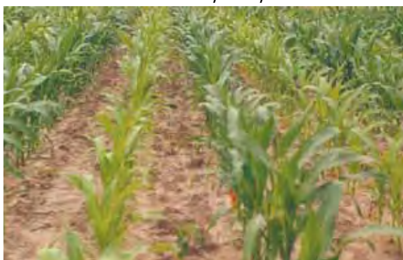
Nitrogen skip pattern in corn