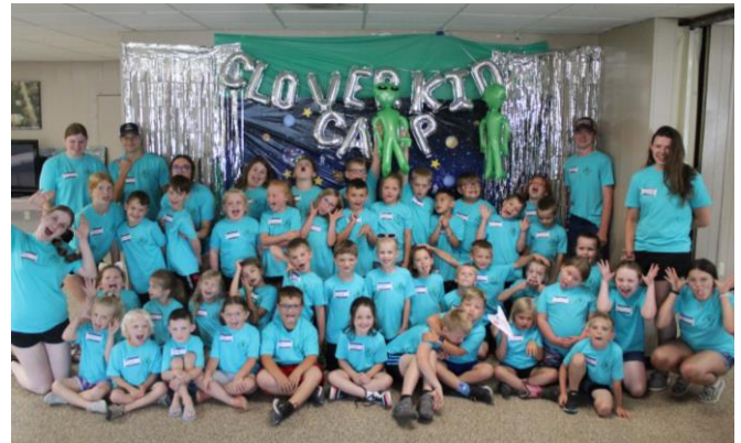
Photo Above: All the Clover Kids and Counselors before starting our space themed Clover Kid Camp! There was 35 youth and 8 counselors.

June 2023 was full of 4-H Camps from one overnight camp and one Clover Kid Camp. The theme for most of these camps was all about space.