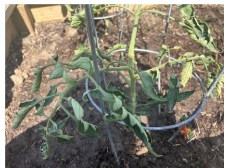
Above is a tomato plant with herbicide damage. Soil testing could offer insight to this issue.

In 2023, the Lafayette Extension office processed over 86 soil samples from lawns, gardens and fields and 2 water samples.