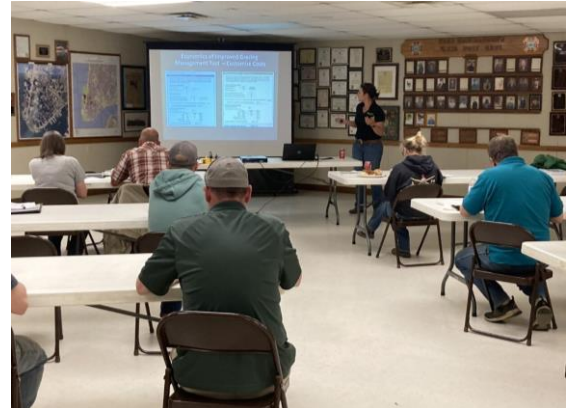
42 participants from Lafayette, Johnson, Pettis, Cass, Hickory, Morgan and Saline Counties were in attendance.

They were given information on the best species to plant for optimal nutrition with cover crops. They heard from producers who have successfully implemented multi-species grazing.